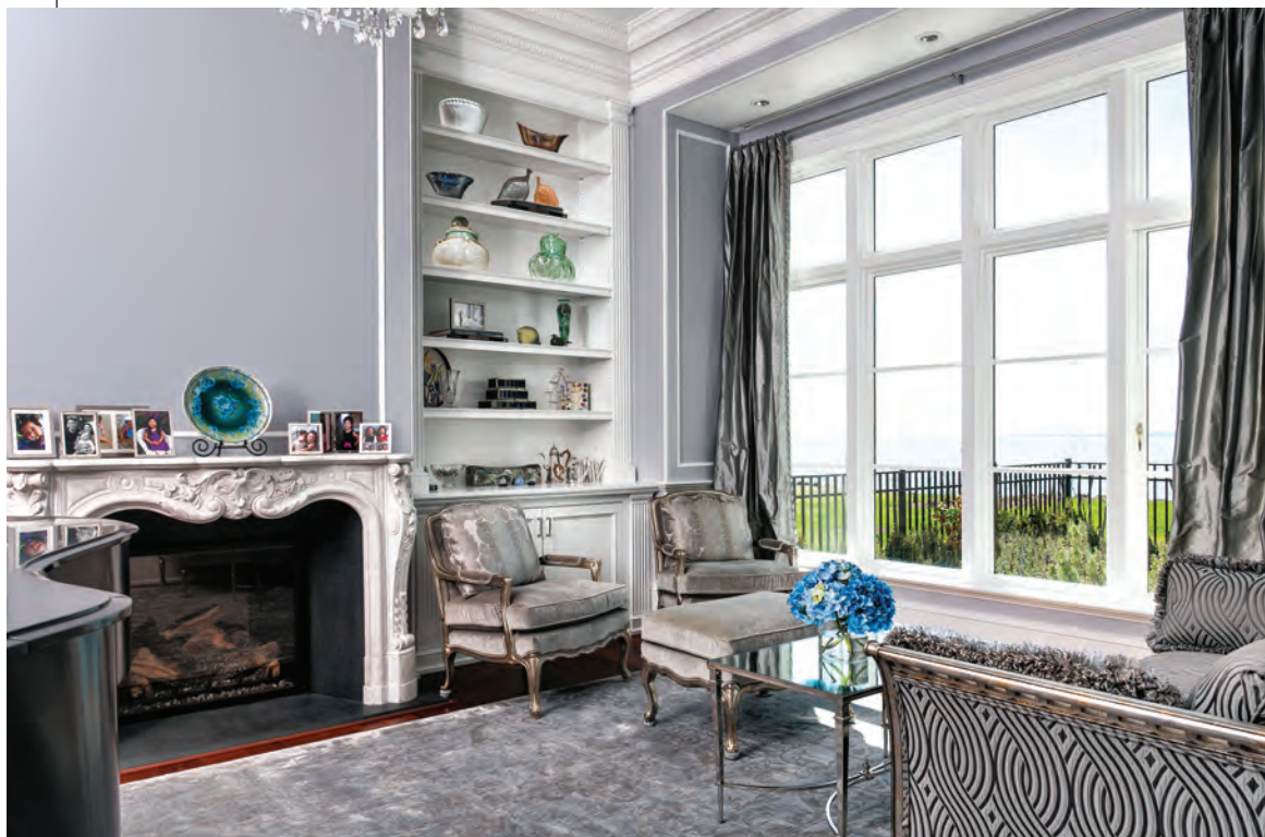
Left: Lavender walls adorn the sitting room, which includes a crystal chandelier and a 19th century marble mantel from Paris.

accessories that supplies retailers, including Nordstrom, Dillard's, Wayfair, Bed, Bath & Beyond and others.