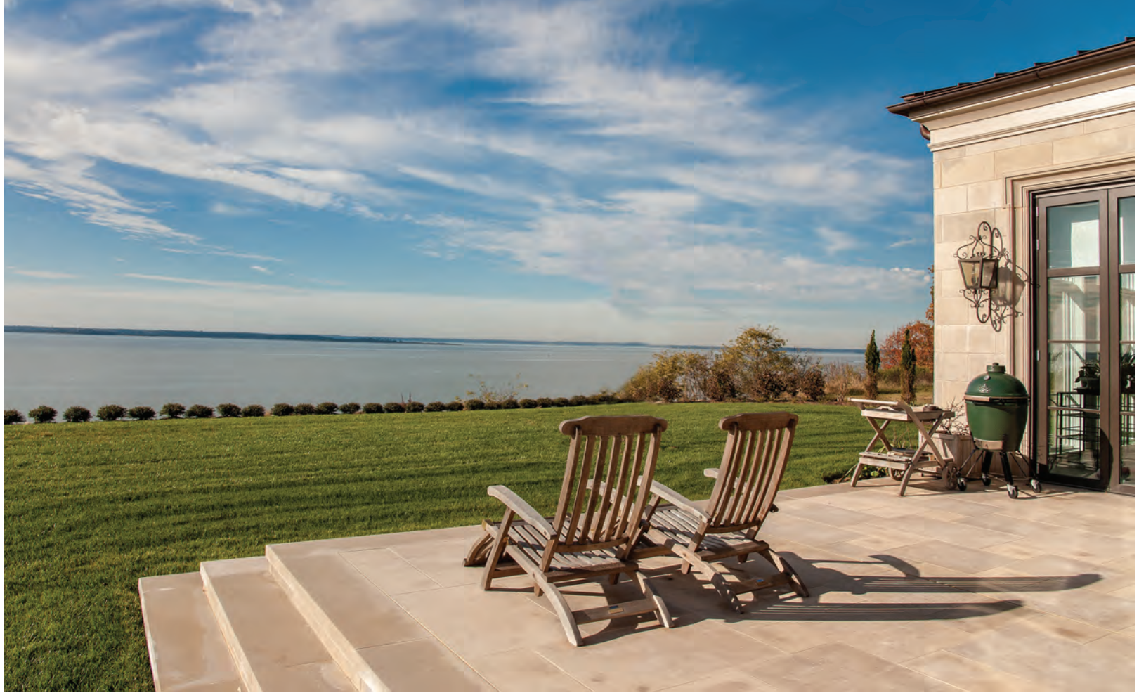
Above: With access from multiple rooms, the patio provides an optimal spot for relaxing and enjoying views of the James River. Below left: An outdoor grill and kitchen create an inviting atmosphere for entertaining on the patio.