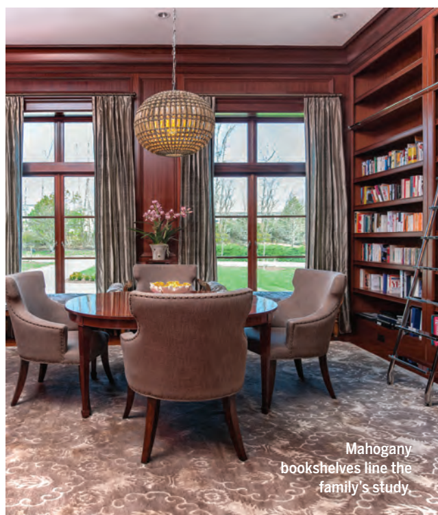
Mahogany bookshelves line the family's study.