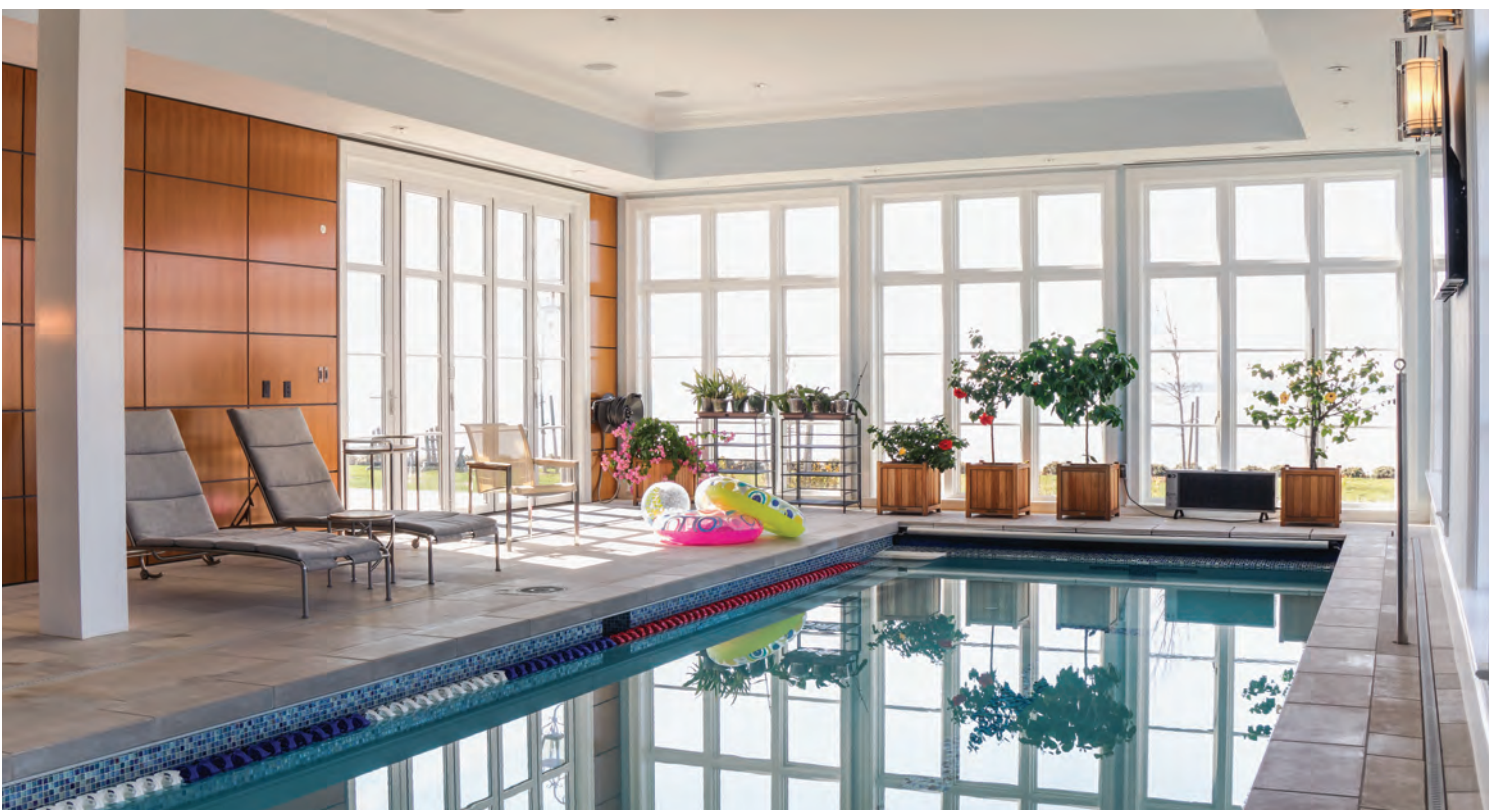
Left, and above right: The family's lap pool was designed by Dominion Pools of Virginia Beach; light blue walls and water views create a calm, cool environment in the pool house.