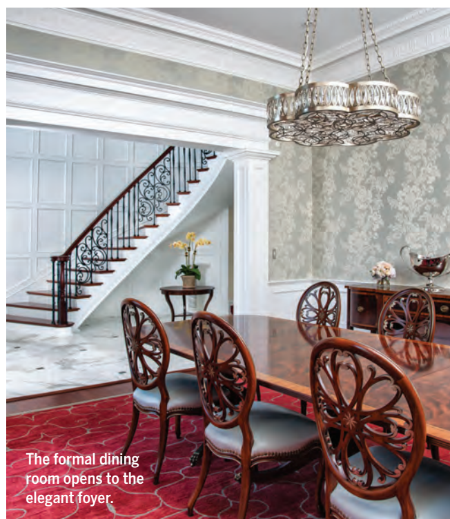
The formal dining room opens to the elegant foyer.