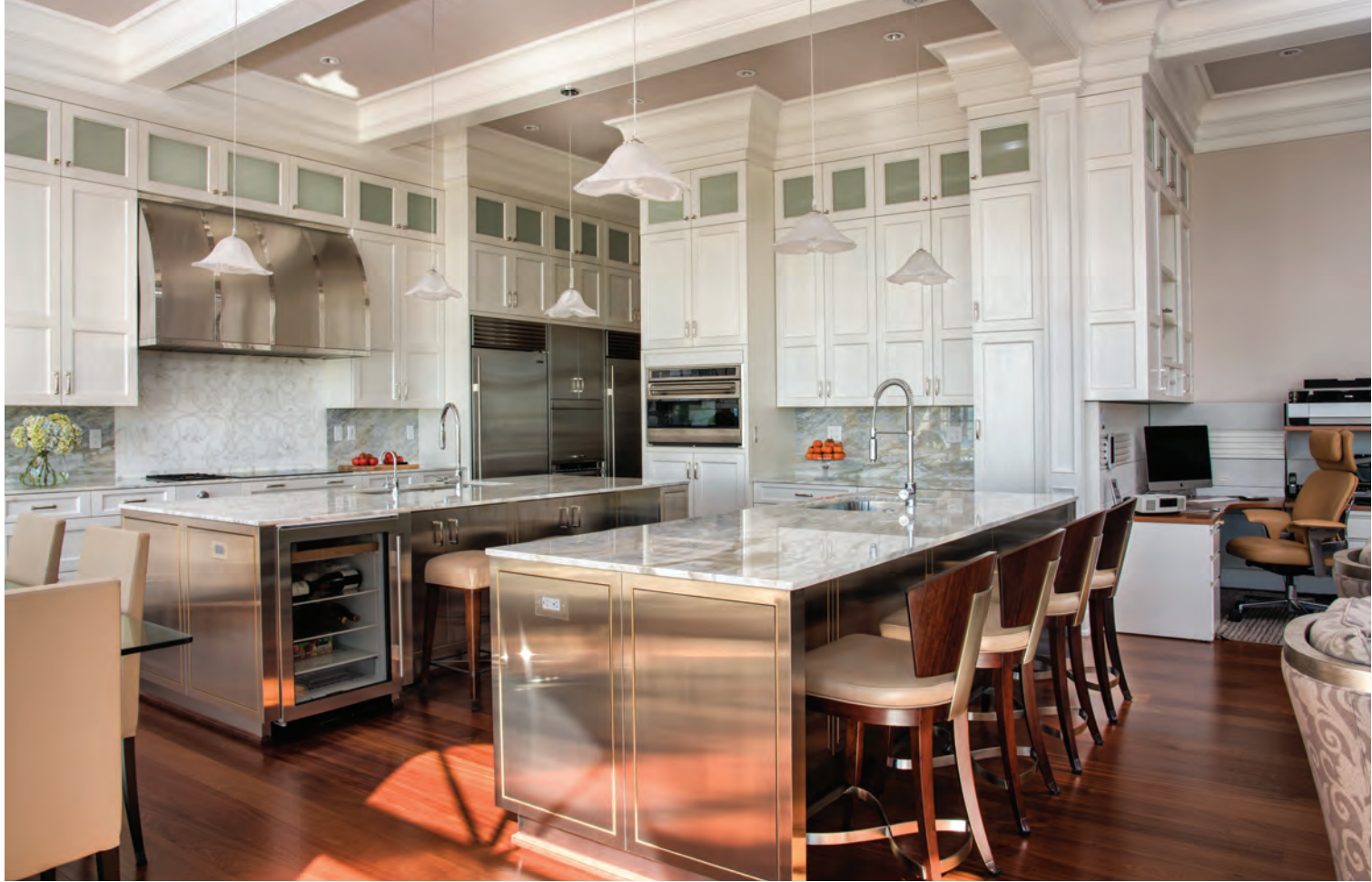
Left: The kitchen has a clean, contemporary look with stainless steel islands, Calacatta Gold marble countertops and delicate pendant lights designed by Richmond's Micheal Sparks.